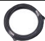
20 Metre IEEE1394/ FireWire Cables