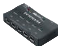
6-port DV Repeater & Distribution Amplifier