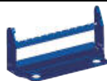
TLM 404/SE800 Mobile Rackmount